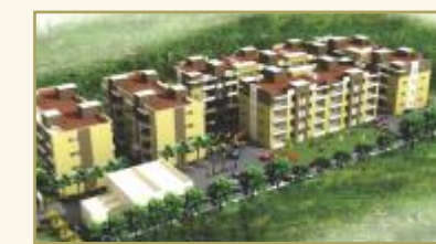
NIRWANA GREENS 2