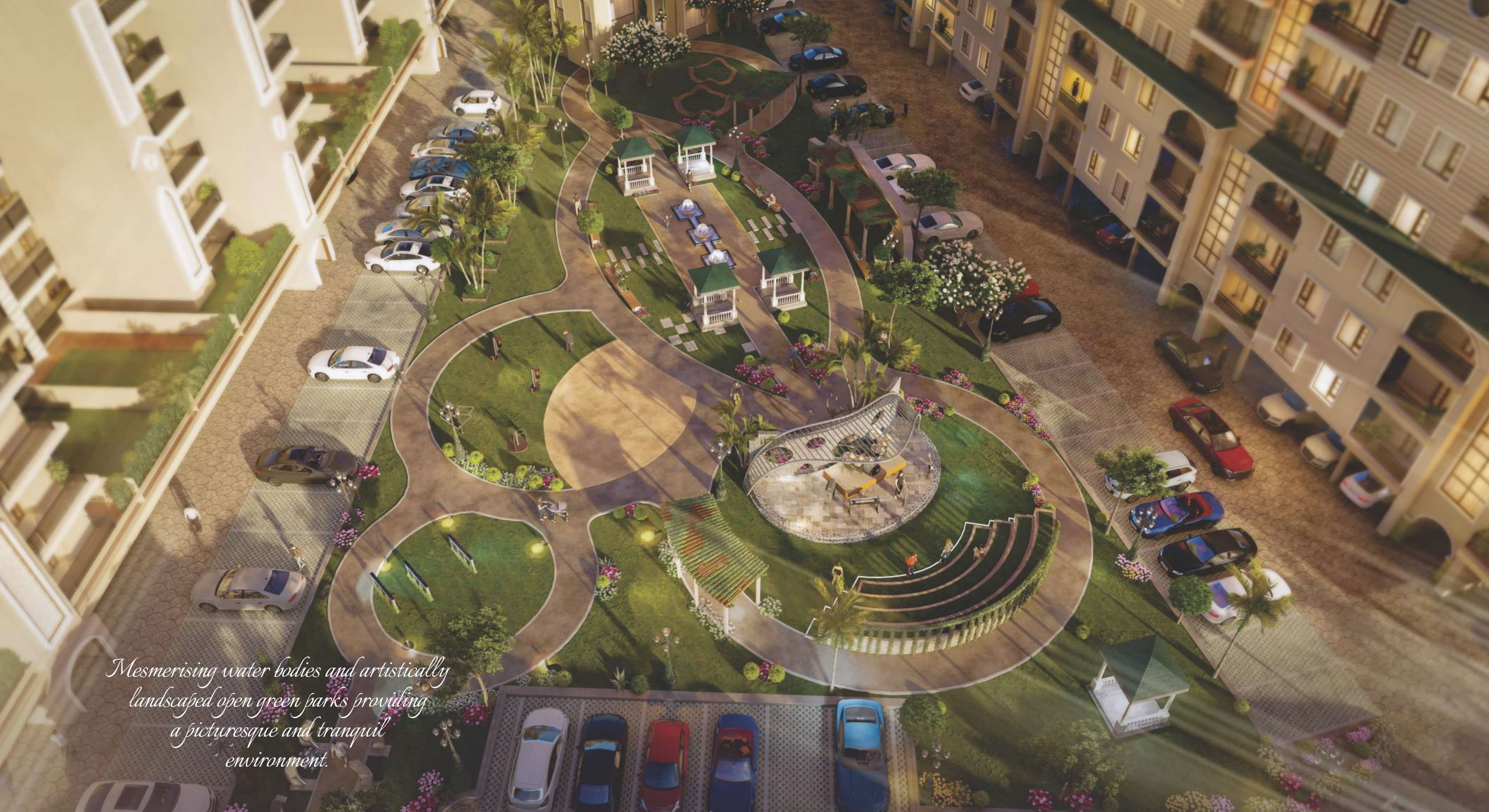
Mesmerising water bodies and artistically landscaped open green parks providing a picturesque and tranquil environment.