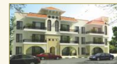
AMARI GREENS EXTN.