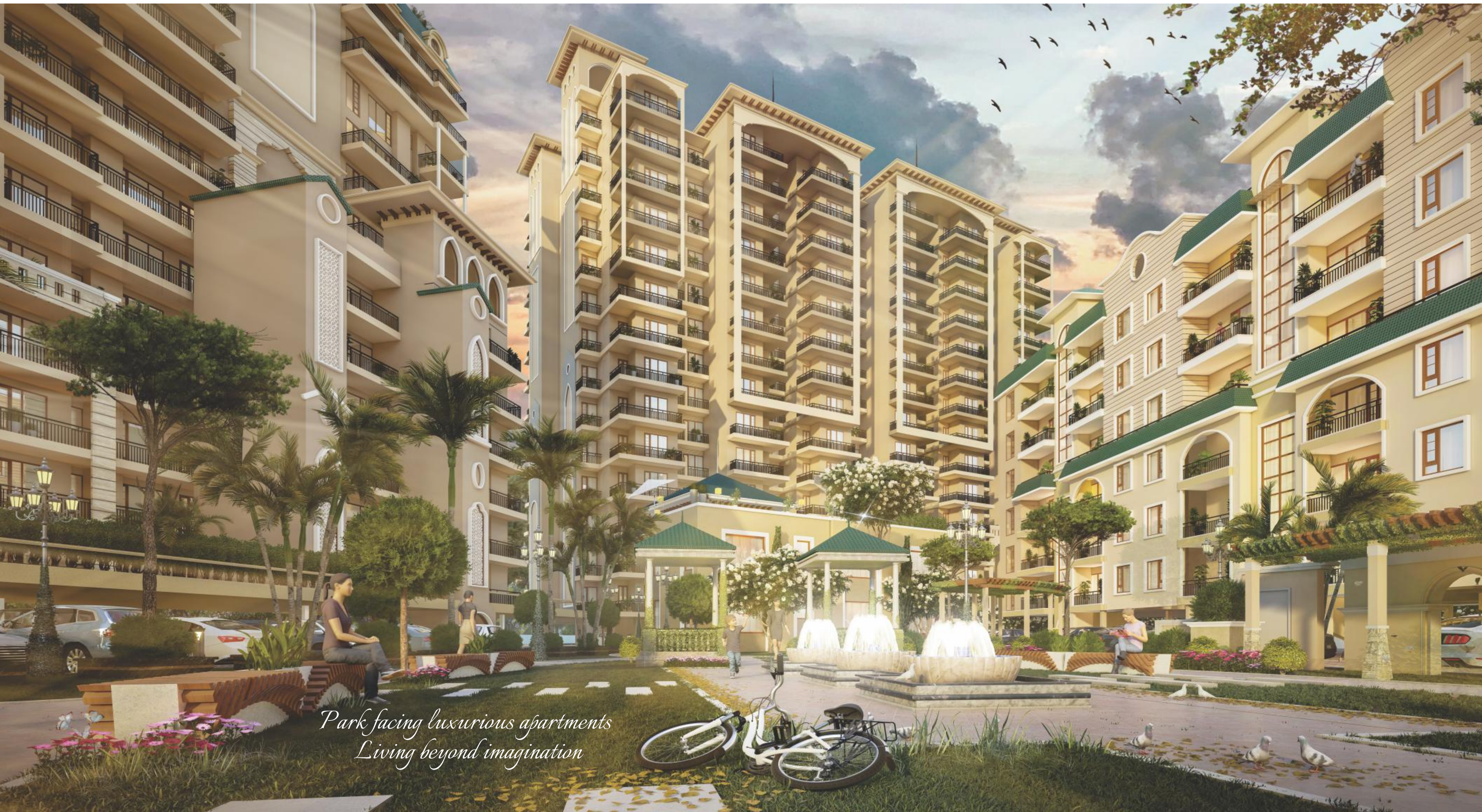
Park facing luxurious apartments Living beyond imagination