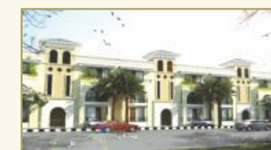
NATURE HUTS 3