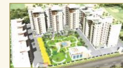
NIRWANA GREENS 4