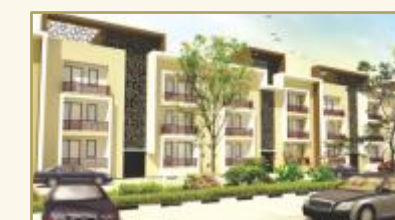
NATURE HUTS 2